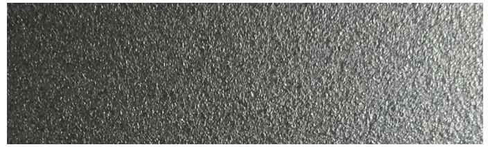
STAINLESS-DULL 4-8 DUL (CUSTOM FINISH)