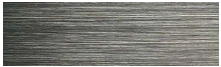
STAINLESS-HAIRLINE 4-8 HL